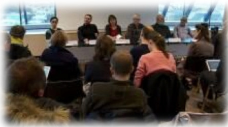
Key organizers communicating to the international media the day before the eclipse, Faroe Islands

Your community should develop an Eclipse Task Force, which should consist of a range of stakeholders from across the region. These should include, but are not limited to, representatives from tourism, council and government, policing, event co-ordination, creative industries, education, health, business, and local media.