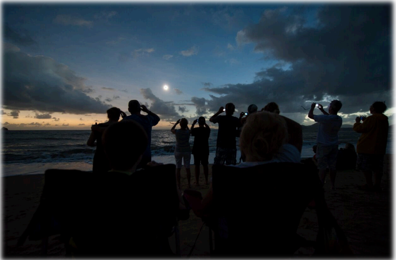
Totality in Palm Cove, Far North Queensland