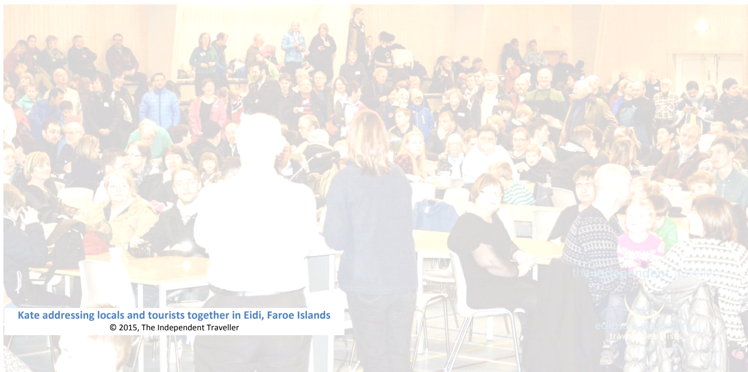
Kate addressing locals and tourists together in Eidi, Faroe Islands

Eclipse-related weather information should be made available in a timely manner so people can make informed choices regarding their viewing location.