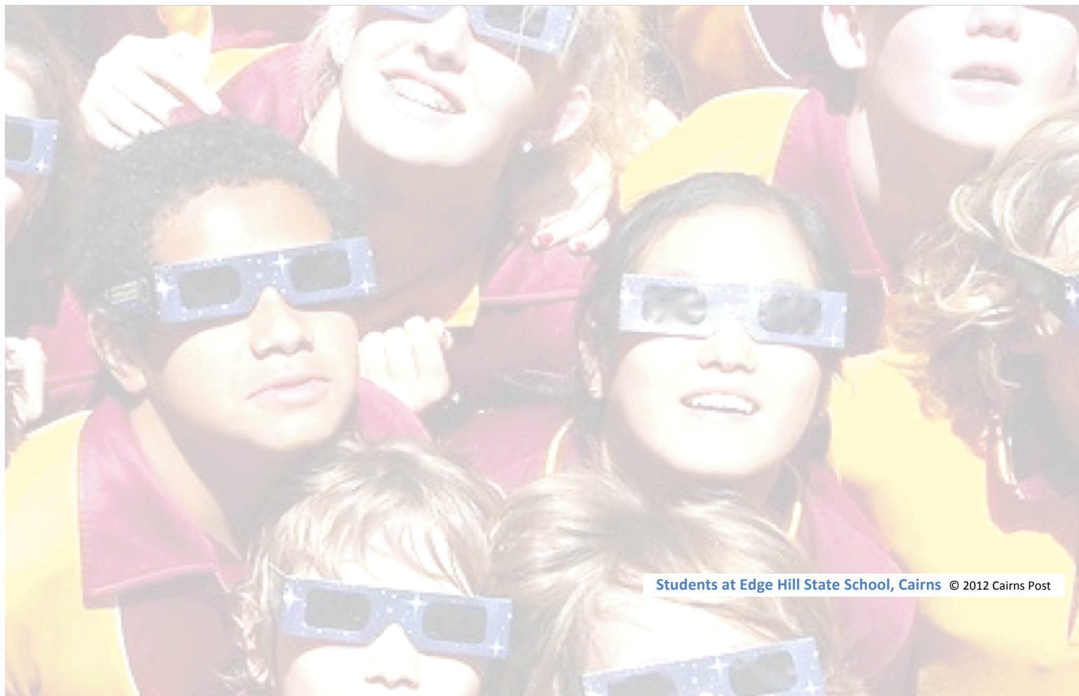
Students at Edge Hill State School, Cairns

If you are in a government or tourism role and are responsible for eclipse planning in your region, Kate is happy to provide a free one-off consultation about your eclipse planning activities. Please see contact details on last page.